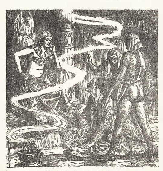
"They threw him down in front of the throne."