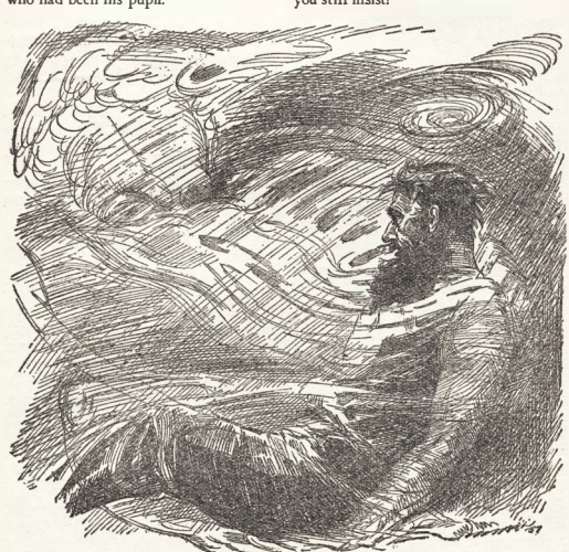
"Upon his breast rested a thing."

"Mon Dieu!" he exclaimed. "Then you still insist?"